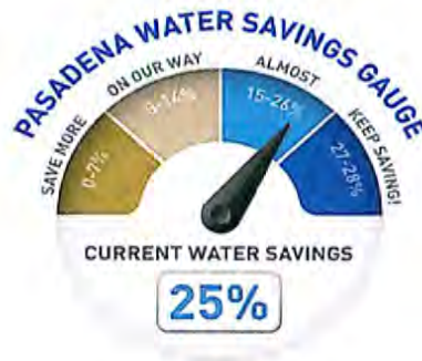
Data from June 1 - Sept. 23, 2015 Help us get to 28% by February!

For a weekly status on how much water Pasadena has conserved to date, the water savings gauge is posted to the city's website http://www.CityofPasadena.net , and can also be seen on KPAS during the Pasadena City Council meetings.