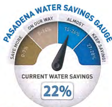
Data from June 1 – Nov. 25, 2015 More conservation is needed to reach our goal. Help us get to 28% to avoid State fines.

PWP is hopeful that the anticipated winter rains will bring the added savings needed to help reach the 28% goal by February 2016. However, officials are urging everyone to continue doing their part to conserve water during this critical time. Since the City Council implemented its Level 2 Water Supply Shortage Plan, Pasadena has saved more than 1.3 billion gallons of water. The gallons of water saved and the 22% conservation data are cumulative results based on water usage by all Pasadena Water and Power (“PWP”) customers from June 1 through November 25, 2015.