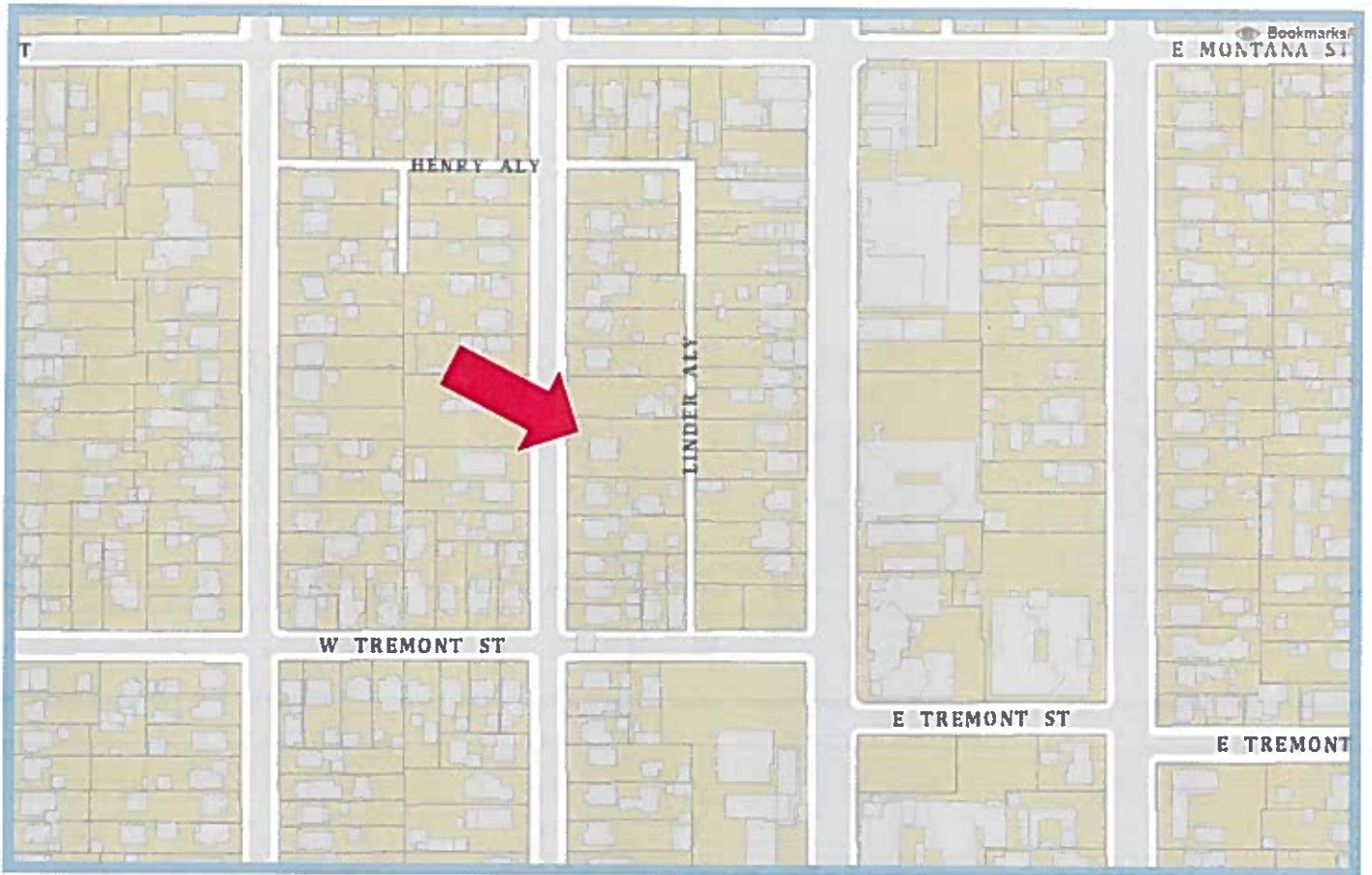
Area Map – 1944 El Sereno Avenue