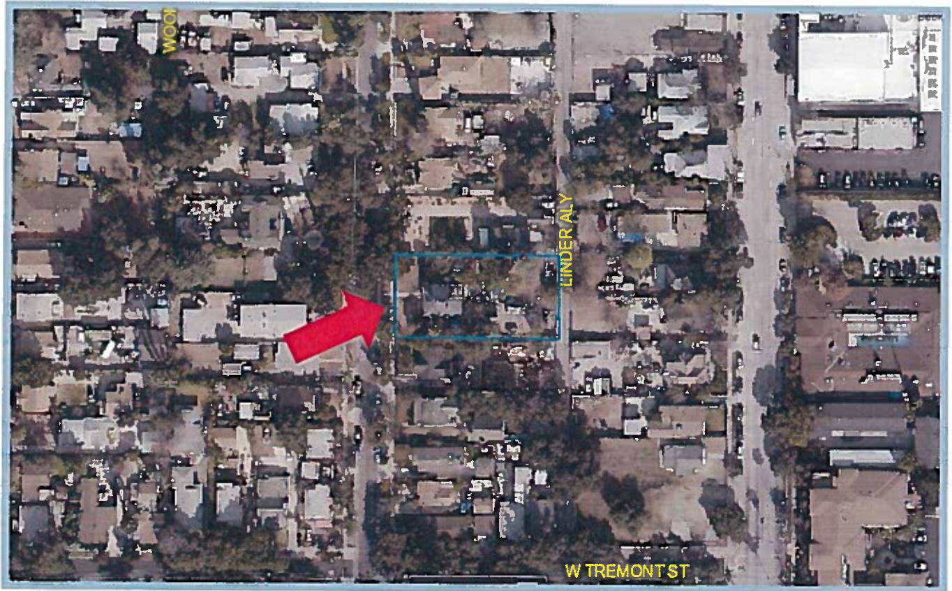
Aerial Photograph – 1944 El Sereno Avenue