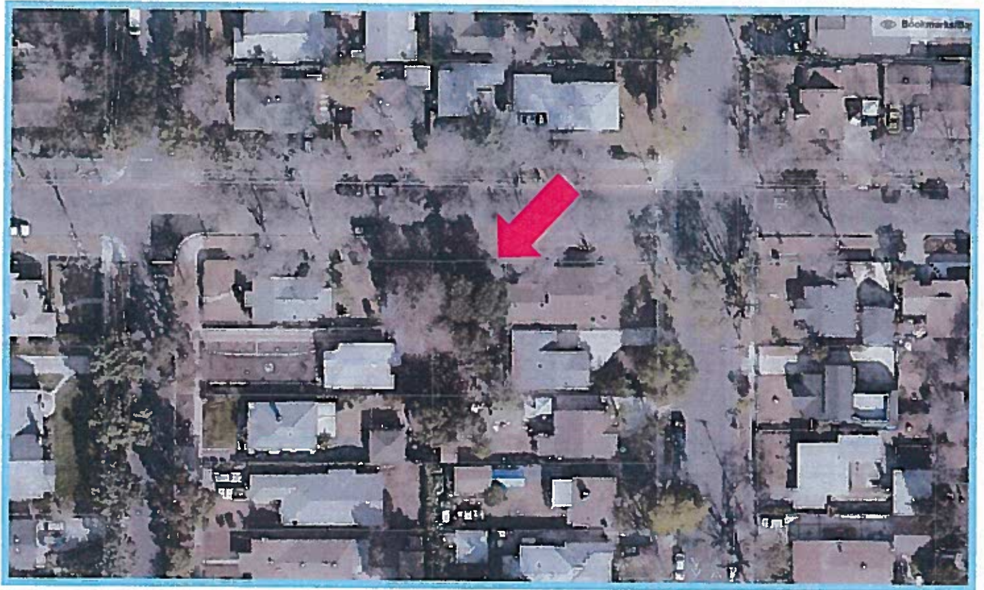
Aerial Photograph – 338 Idaho Street