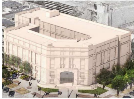
United States Post Office, 8 th and Edmond, St Joseph, MO

I did however discover this rendering in Pasadena Now which was found on Page 80 of Attachment B of the Applicant Submittal Package, Ramona Senior Housing Preliminary Design Consultation .