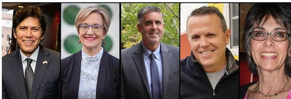
COUNCILMEMBER KEVIN DE LEÓN Council District 14