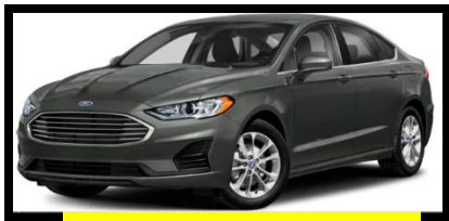
NOT ACTUAL VEHICLE