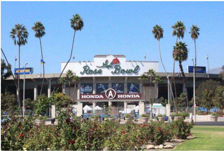
Rose Bowl Stadium

DESCRIPTION: This project provides for maintenance and upgrades to the Rose Bowl facility on an annual basis. This will address preventative maintenance work including: electrical; plumbing, irrigation, sewage and drainage; structural; HVAC; concrete, stone, and asphalt surfaces; floor, wall, ceiling, and roof surfaces; preventive maintenance to scoreboards and video boards; and other miscellaneous repairs and services.