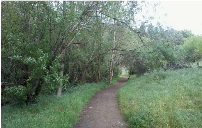
Lower Arroyo Seco

DESCRIPTION: This project provides for habitat restoration within the vicinity of the Van de Kamp Bridge. This project will enhance, conserve, and restore the native plant community through the removal of non-native plant species and the planting of native trees and understory. A five-year environmental and habitat monitoring effort will ensure the successful establishment and sustainability of the restoration scope.