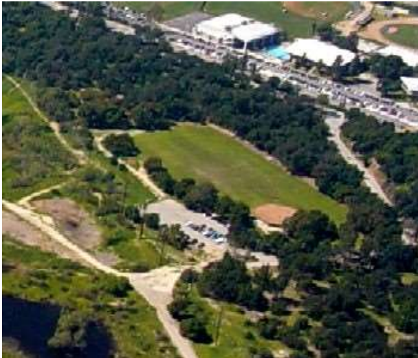
Hahamongna Watershed Park - 2024 Oak Grove Dr.

DESCRIPTION: This project provides for re-surfacing of the entry road and parking lot in the area of the existing Oak Grove field, including ADA, stormwater, landscaping, and parking space improvements.