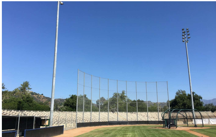
Jackie Robinson Baseball Field

DESCRIPTION: This project provides for installation of foul ball safety netting along the first and third base foul lines.