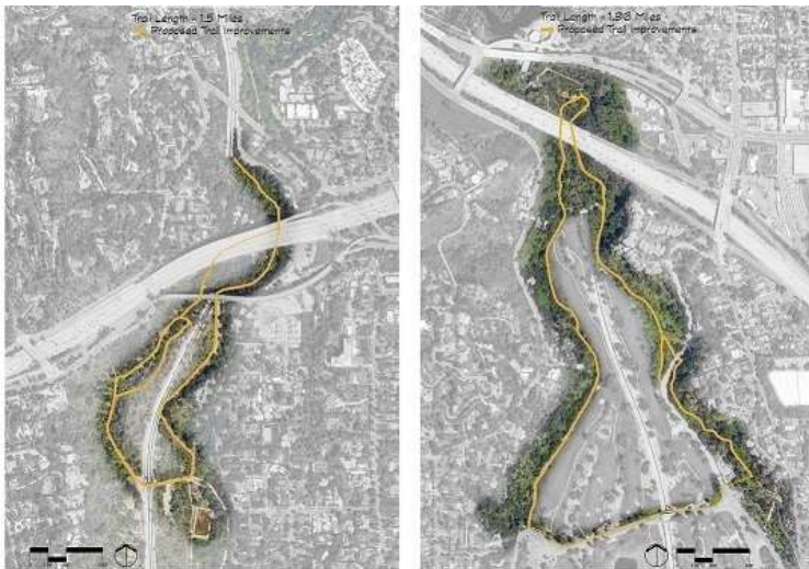
Lower Loop and Upper Loop

DESCRIPTION: This project provides for the construction of the Upper Arroyo Trail Loop and Lower Arroyo Trail Loop portion of the One Arroyo demonstration projects. The construction will focus on restoration and enhancement of the trail in these two critical linkages. Key improvements will be developed in conjunction with public input. These could include safety and wayfinding improvements, improved access for users, connectivity improvements and trail enhancements, while being sensitive to the natural environment of these portions of the Arroyo.