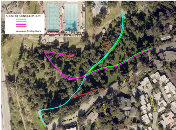
Central Arroyo Areas of Consideration for Trail Improvements

DESCRIPTION: This project provides for a concept study to determine the feasibility of constructing a staircase as an additional recreational amenity within the Central Arroyo.