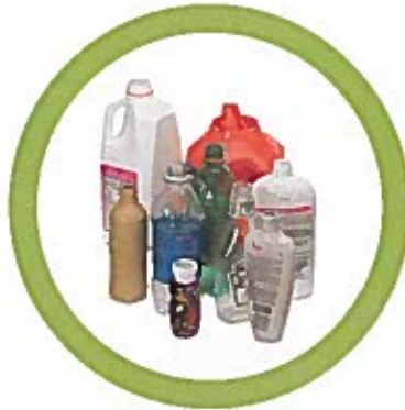
Plastic Containers No. 1 & 2