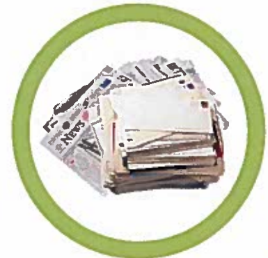
Mail, Newspaper & Magazine