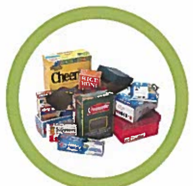
Food Boxes & Paper Packaging