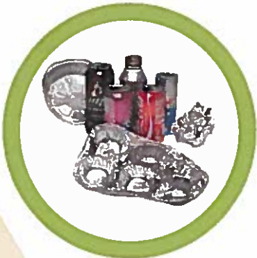
Aluminum Cans & Foil