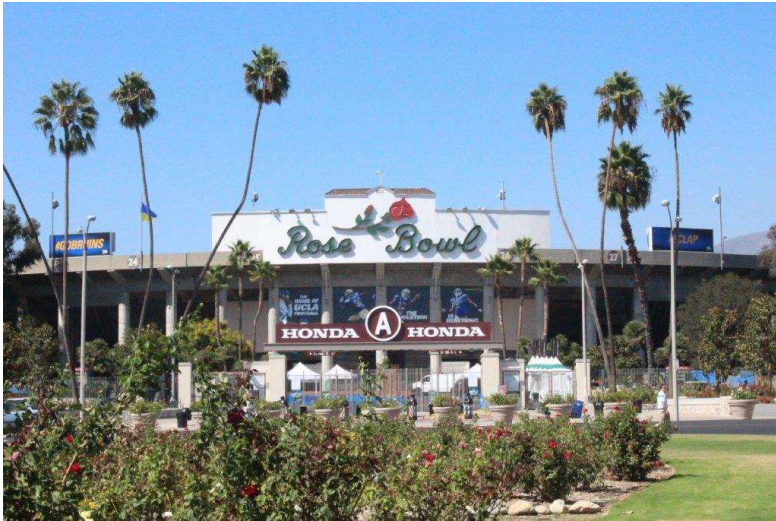
Rose Bowl Stadium

DESCRIPTION: This project provides for maintenance and upgrades to the Rose Bowl facility on an annual basis. This will address preventative maintenance work including: electrical; plumbing, irrigation, sewage and drainage; structural; HVAC (heating, ventilation and air conditioning); concrete, stone, and asphalt surfaces; floor, wall, ceiling, and roof surfaces; preventive maintenance to scoreboards and video boards; and other miscellaneous repairs and services.