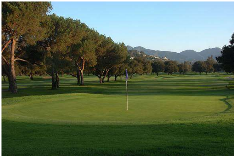
Brookside Golf Course - 1133 N. Rosemont Ave.

DESCRIPTION: This project provides for fairway and golf course improvements at Brookside Golf Course.