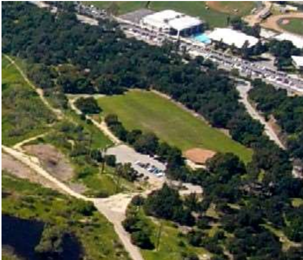
Hahamongna Watershed Park - 2024 Oak Grove Dr.

DESCRIPTION: This project provides for improvements to and re-surfacing of the entry road and parking lot in the area of the existing Oak Grove field.