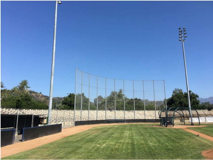
Jackie Robinson Baseball Field

DESCRIPTION: This project provides for installation of foul ball safety netting along the first and third base foul lines.