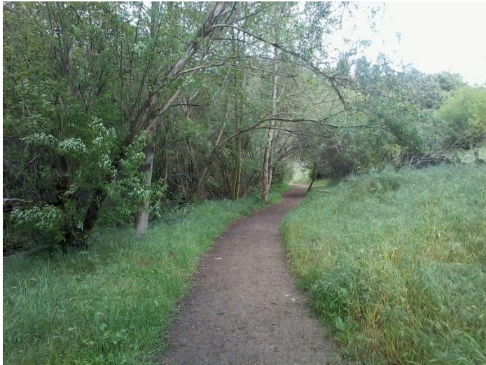
Lower Arroyo Seco

DESCRIPTION: This project provides for habitat restoration within the vicinity of the Van de Kamp Bridge. This project will enhance, conserve, and restore the native plant community through the removal of non-native plant species and the planting of native trees and understory. A five-year environmental and habitat monitoring effort will ensure the successful establishment and sustainability of the restoration scope.